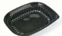
127 QuikPak™ Single Portion Black Base Sold separately